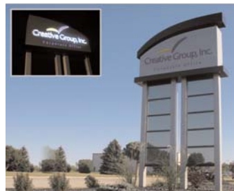
2nd Place "Creative Group Inc. Pylon" Appleton Sign Company