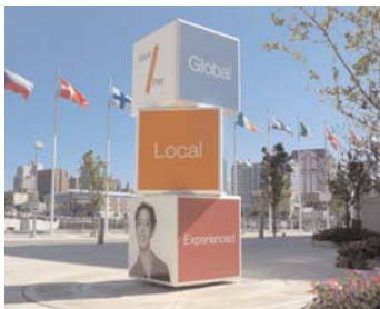
1st Place "Manpower Int'l Headquarters" Poblocki Sign Company