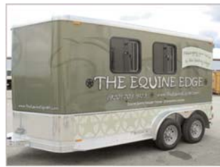
2nd Place "The Equine Edge" Horse Trailer Wrap Appleton Sign Company