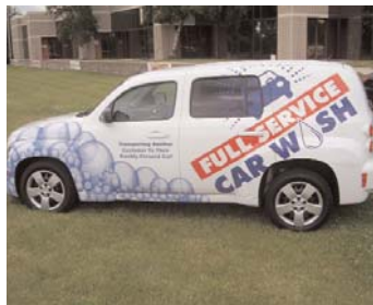
1st Place "Full Service Car Wash Chevy HHR Wrap" Innovative Signs