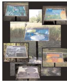
1st Place "Barkhausen Waterfowl Preserve" Orde Sign & Graphics, Inc.