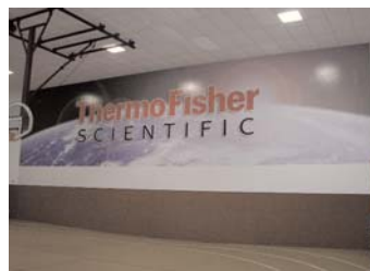
2nd Place "ThermoFisher Gym Wall Mural" Badger Display Signs