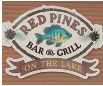
2nd Place "Red Pines" LaCrosse Sign Co. Inc.