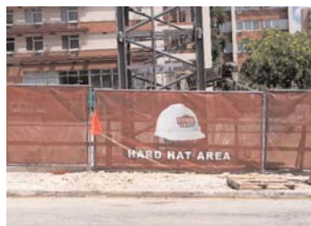
1st Place "Stevens Const. Mesh Jobsite" Badger Display Signs