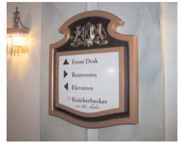
2nd Place "Knickerbocker Hotel" Badger Lighting and Signs