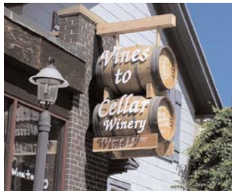
2nd Place "Vines to Cellar" Sheboygan County Signs