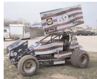
3rd Place "Modified Sprint Car Full Wrap" Sheboygan County Signs