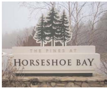
1st Place "The Pines at Horseshoe Bay" Appleton Sign Company