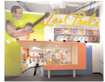
2nd Place "Les Paul's Exhibit" Poblocki Sign Company