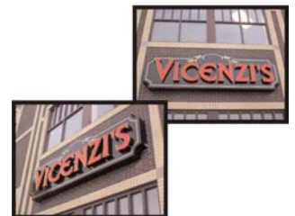
2nd Place "Vicenzi's" Orde Sign & Graphics, Inc.