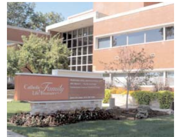
2nd Place "Catholic Family Life Insurance" Poblocki Sign Company