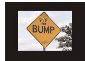
1st Place "Bump" Alpha Neonx