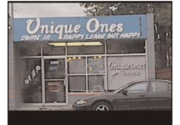
2nd Place "Unique" Alpha Neonx