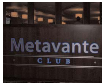
1st Place "Metavante" Poblocki Sign Company