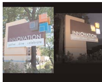
1st Place "Innovation Pylon" Alpha Neonx