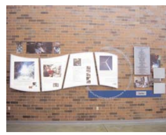
1st Place "Matc ECAM Donor Wall" Poblocki Sign Company