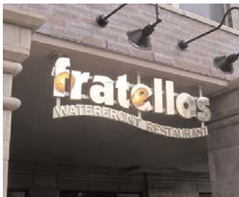
BEST OF SHOW/1st Place "Fratellos Waterfront Restaurant" Sheboygan County Signs