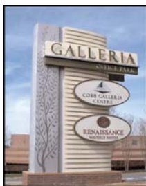
1st Place "Galleria Office Park" Poblocki Sign Company