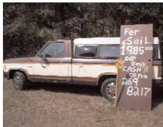
1st Place "Fer Sail" LaCrosse Sign Company