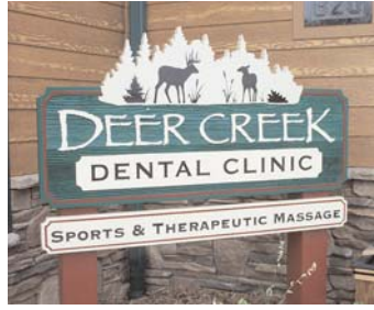
2nd Place "Deer Creek Dental" LaCrosse Sign Company