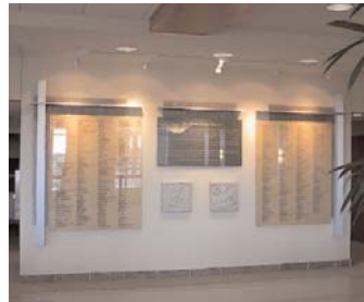
1st Place "St. Joseph's Community Hospital" Poblocki Sign Company