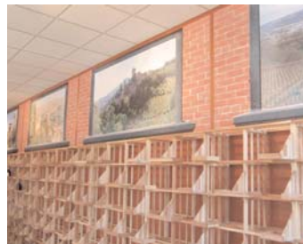
2nd Place "Wine Guyz" LaCrosse Sign Company