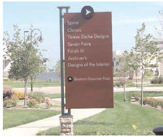
1st Place "Greenway Station" JNB Signs