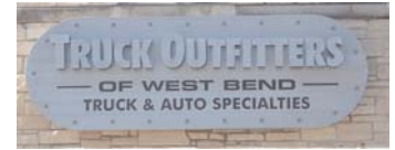
2nd Place "Truck Outfitters" Cochran Sign Co., Inc.