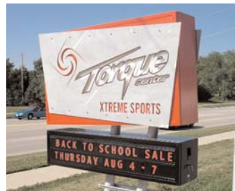
2nd Place "Torque Center" Poblocki Sign Company