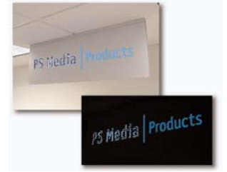
2nd Place "PS Media" Poblocki Sign Company