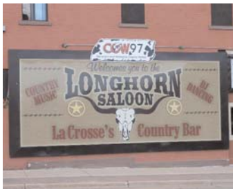
1st Place "Longhorn Saloon/Cow 97 Radio" LaCrosse Sign Company