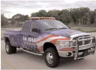
1st Place "FM 106.1" Innovative Signs, Inc.