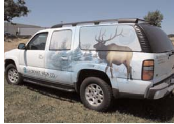
2nd Place "Sunset Elk Farm" LaCrosse Sign Company