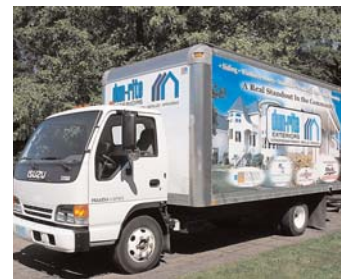
2nd Place "Dun-Rite" D&L Signs Inc.