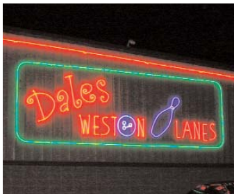
BEST OF SHOW "Dale's Weston Lanes" D&L Signs Inc.