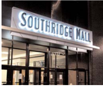
1st Place "Southridge Mall" Poblocki Sign Company