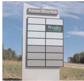
1st Place "Putnum Office Park" D&L Signs Inc.