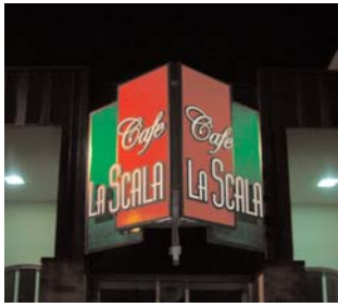
1st Place "Cafe La Scala" Poblocki Sign Company