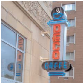
1st Place "Caffè Deco/Ambassador Hotel" Alpha Neonx Sign