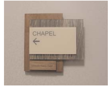
2nd Place "Angels Grace Hospice" Poblocki Sign Company