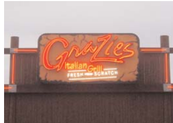
2nd Place "Grazies Italian Grill" Appleton Sign Company