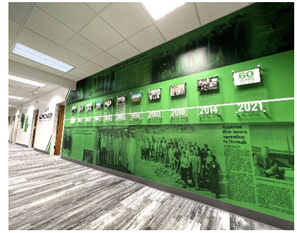
3 rd Place - “Kundinger - History Wall” Appleton Sign Co. Designed by: Mike Frassetto