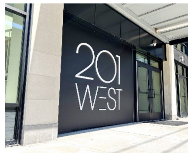
2 nd Place - “201 West” Appleton Sign Co. Designed by: Mike Frassetto