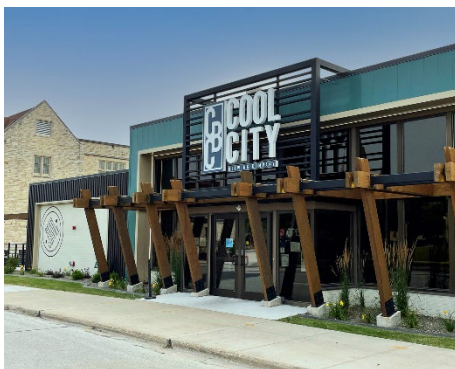
1 st Place – “Cool City” Creative Sign Co. Designed by: Timothy Porter