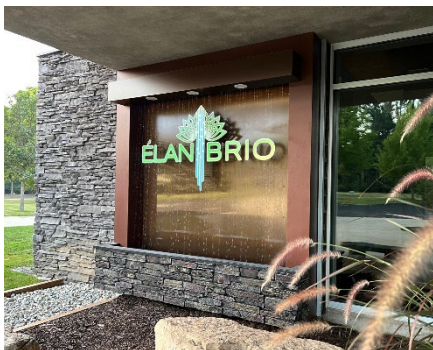
1 st Place - “Elan Brio Spa” Appleton Sign Co. Designed by: Mike Frassetto