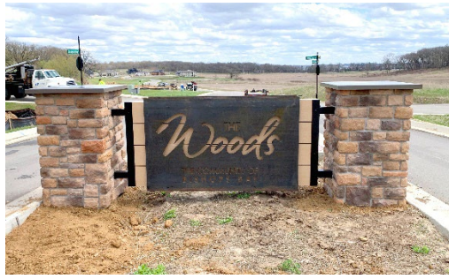
2 nd Place - “The Woods” Poblocki Sign Designed by: Israel Hill