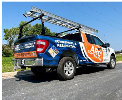
2 nd Place - “ARC Contracting” Appleton Sign Co. Designed by: Mike Frassetto