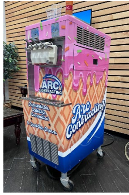
2 nd Place – “ARC Ice Cream Machine Wrap” Appleton Sign Co. Designed by: Mike Frassetto