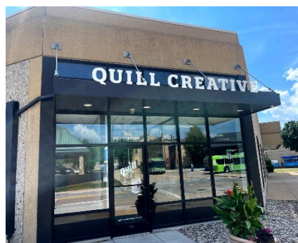
2 nd Place - “Quill Creative” Appleton Sign Co. Designed by: Dane Schumacher