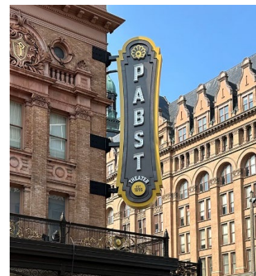
3 rd Place - “Pabst Theatre” Elevated Identity Designed by: Jason Gierl & Luke Edgewood