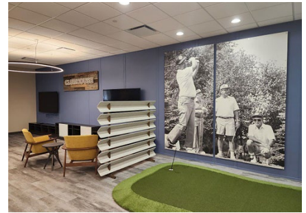
3 rd Place - "US Venture Clubhouse" Elevate97 Designed by: Cory Marcin