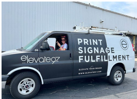
1 st Place - “Elevate97 Install Vehicle” Elevate97 Designed by: Cory Marcin