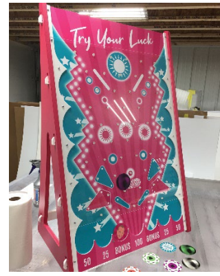
3 rd Place - “Plinko” Creative Sign Co. Designed by: Timothy Porter