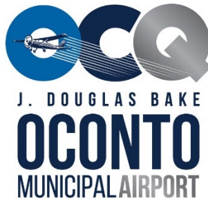
2 nd Place – “Oconto Airport” Creative Sign Co. Designed by: Bill Vandermause