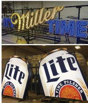
1 st Place - "White Sox - Miller Time" Poblocki Sign Designed by: Israel Hill