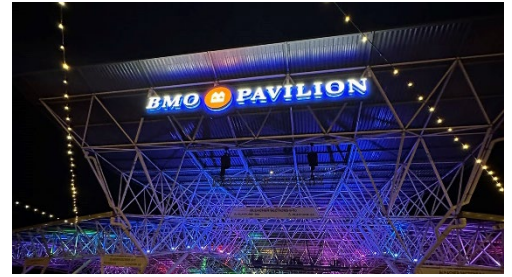
3 rd Place - "BMO Pavilion - Summerfest" Elevated Identity Designed by: Marshall Hogan