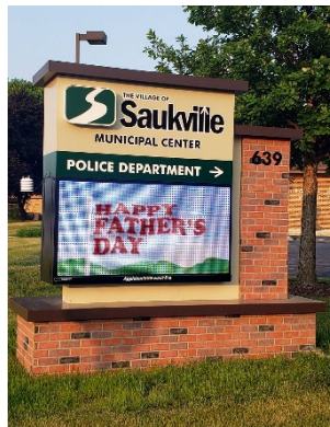
2 nd Place - “Village of Saukville” Appleton Sign Co. Designed by: Mike Frassetto & Dane Schumacher