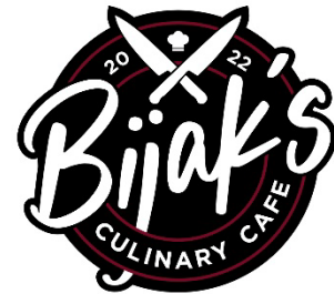
3 rd Place - “Bijak's Culinary Cafe” Appleton Sign Co. Designed by: Mike Frassetto