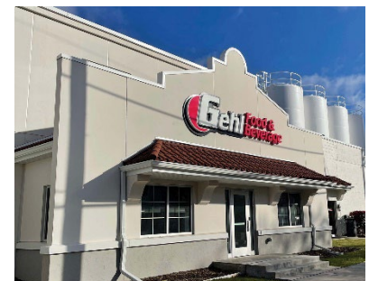
3 rd Place - “Gehl Foods” Creative Sign Co. Designed by: Nicole Mattson