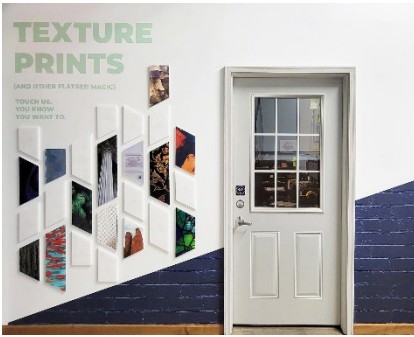
1 st Place – “Texture Paints” Creative Sign Co. Designed by: Timothy Porter