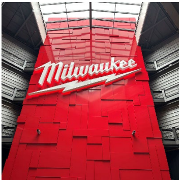
1 st Place - "Milwaukee Tool" Elevated Identity Designed by: Luke Edgewood